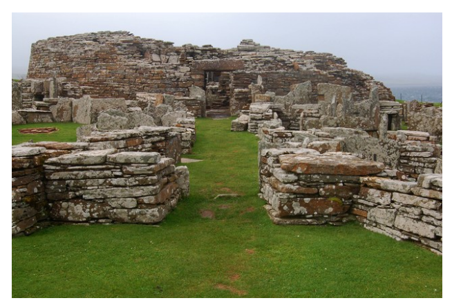
Fig. 4. Causeway lined with houses. John Allan [CC BY-SA 2.0]

The broch originally had a single central hearth, stone cupboards, and a sunken feature interpreted as a 'well': a large cavity cut out of the bedrock, perhaps before the broch was built. Stone steps led down to a chamber with a cistern. When the broch collapsed after years of neglect, its upper sections were dismantled, probably for building material. The 'well' was filled in and the interior partitioned with upright sandstone flags forming two distinct living quarters, as seen today. Each 'room' had its own hearth and double-decker compartments, used either for storage or as beds. Stairs (Fig. 5) led to an upper storey in the smaller of the two rooms.