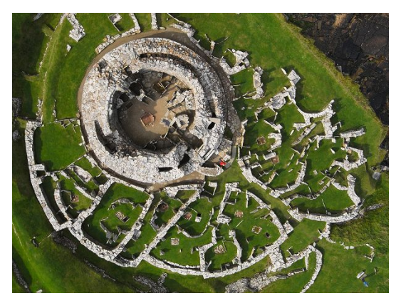
Fig. 3. Kite aerial view of the Broch of Gurness.

Broch of Gurness (Fig. 1) is one of the best surviving brochs. This type of Iron Age settlement, is unique to northern and western Scotland with 500 examples spread throughout the Highlands and the islands. Many of the tall circular towers stood alone, but in Orkney they were usually surrounded by large villages. Until 1929, only a large grassy mound, known as the Knowe o' Aikerness, stood by the shore. Orcadian poet and antiquarian, Robert Rendall discovered the remains while sketching. His stool sank into the mound, revealing a set of stone steps. Excavations soon uncovered the full extent of the broch and the village, but World War II intervened. The site was revisited in the 1950s, to consolidate the remains for public access but it was much later that the material was pieced together by John Hedges (1987) who concluded that the village was occupied from 200 to 100 BC, and was built on an earlier settlement.