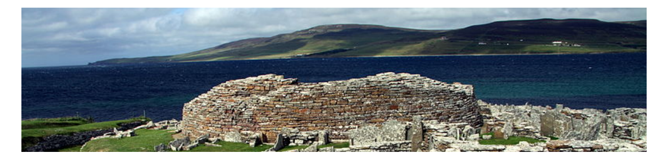
Fig. 1. Broch of Gurness.

Access & ownership: The site is managed by Historic Scotland. It is open only in Summer (25 March-30 September) Mon-Sun, 9.30am to 5.30pm (last entry 5pm). There is an admission charge. Parking available 180 m away from site. Most of the site is accessible to visitors using wheelchairs or with limited mobility but assistance is recommended.