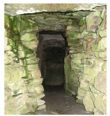
Fig. 3. Passage to chamber in Camster long cairn.

Camster Long is 60 m in length with 'horns' extending at each end. It is 20 m wide at the NE end, narrowing to 10 m at the SW. The horns at the north end define a clear forecourt with a platform at the back. This gives it a modern stage-like appearance. Two burial chambers open from the east side of the long cairn. Both were originally constructed as separate freestanding round cairns with passages just 2m long. The north chamber is polygonal and had a corbelled roof in 1866 (now a fibreglass dome); the south chamber is subdivided by transverse slabs set in the wall — a type of chamber found elsewhere in Caithness, and in Orkney where they are enormously elongated. It was roofless in 1866. Excavation revealed a few fragments of human bones mingled with broken animal bones.