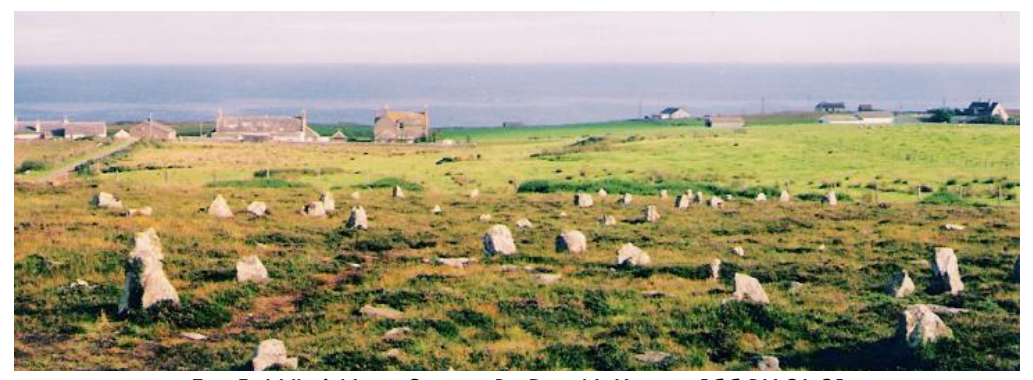
Fig. 5. Hill o' Many Stanes.