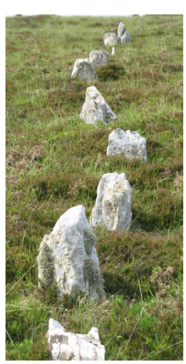
Fig. 4. Detail of stone row.

A more impressive example of a stone row fan lies 6 km away at 'The Hill o' Many Stanes' at Mid Clyth. Here, over 170 stones less than a metre high remain firmly set in the ground (Figs 4 and 5), although at the end of the 19th century more than 400 were recorded (Anderson 1886). Removal for building probably explains the gaps in the rows. From the higher northern end of the rows, the hills of Banffshire can be seen across the Moray Firth, some 80 km away. The moon appears over those hills in its most southerly rising position and Alexander Thom (1971) believed the stone rows to be a Bronze Age observatory, tracking lunar movements over a cycle of 18.6 yrs.