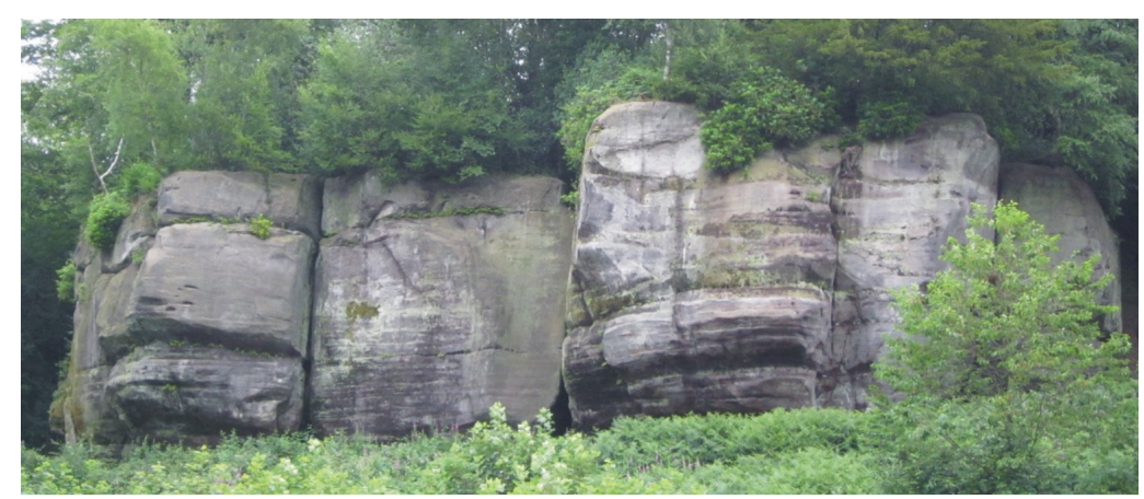
Fig. 1. The Tunbridge Wells Sandstone outcrop showing the type of overhang which could be used for shelter by hunting groups

Access & ownership: High Rocks (TQ 561 382) can be reached either from the A26 south of Tunbridge Wells via Major Yorke's Road, Hungershall Park and High Rocks Lane, or from the A26 west of Tunbridge via Tea Garden Lane. During weekends from March to November and some other days (timetable online) it can also be reached by the Spa Valley Railway (a Heritage Railway) from Tunbridge Wells West or Eridge mainline stations. The site lies within the gardens of the High Rocks Hotel and a fee is payable to enter, tickets from the Lower Bar of the Hotel – at the time of writing it is not open on Mondays.