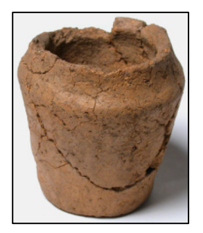
Fig. 5-7. Finds from Doll Tor held at Weston Park Museum. Fig 5 (left): arrowhead; Fig 6 (centre): faience bead; Fig 7 (right): urn.