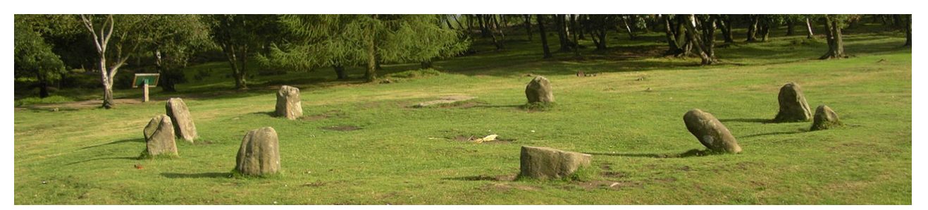
Fig. 1. Nine Ladies stone circle.

Access & ownership: Stanton Moor is a designated Scheduled Ancient Monument. The stone circle is a 10-minute walk from the road.