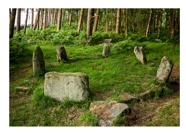
Fig. 3. Doll Tor

Finds from excavations by the Heathcotes in the 1930s can now be seen at the Weston Park Museum, Sheffield, including a fine barbed and tanged flint arrowhead (Fig. 5a), 3.7 cm in length, found just outside the stone circle, close to one of the stones. At the base of the stone, inside the circle, was a cremation deposit.