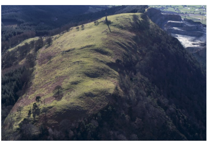
Fig. I. The Breiddin

The Breiddin ('Br-eye-then') hillfort, one of the largest in the region, occupies the ridge of volcanic rock that forms the western side of the distinctive block of hills emerging from the Severn valley. It is part of a dense band of hillforts that extends along the Wye Valley and the tributaries of the Severn, into the central Marches, and onward via the Clwydian Range to the North Wales coast. Much of the hillfort has been lost to quarrying; only the ramparts, the entrance, and the NE part of the hill now remain but these, and the views from the summit are ample reward for the walk up through the forest.